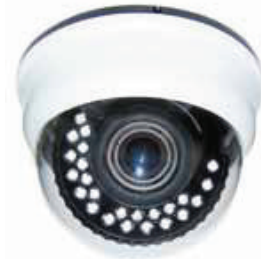
Vari Focal Lens