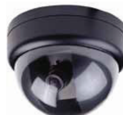
RYK-2Jxx (Vandal Proof)