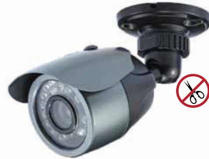
Concealed Cable Bracket