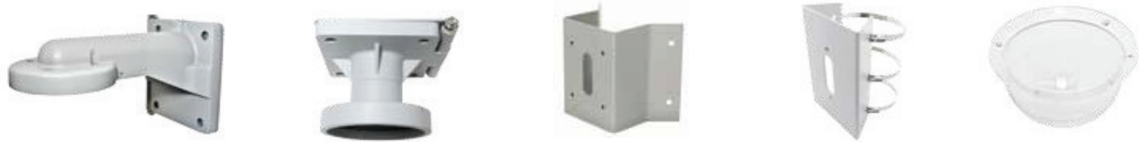
RYK-8728 Wall Mount